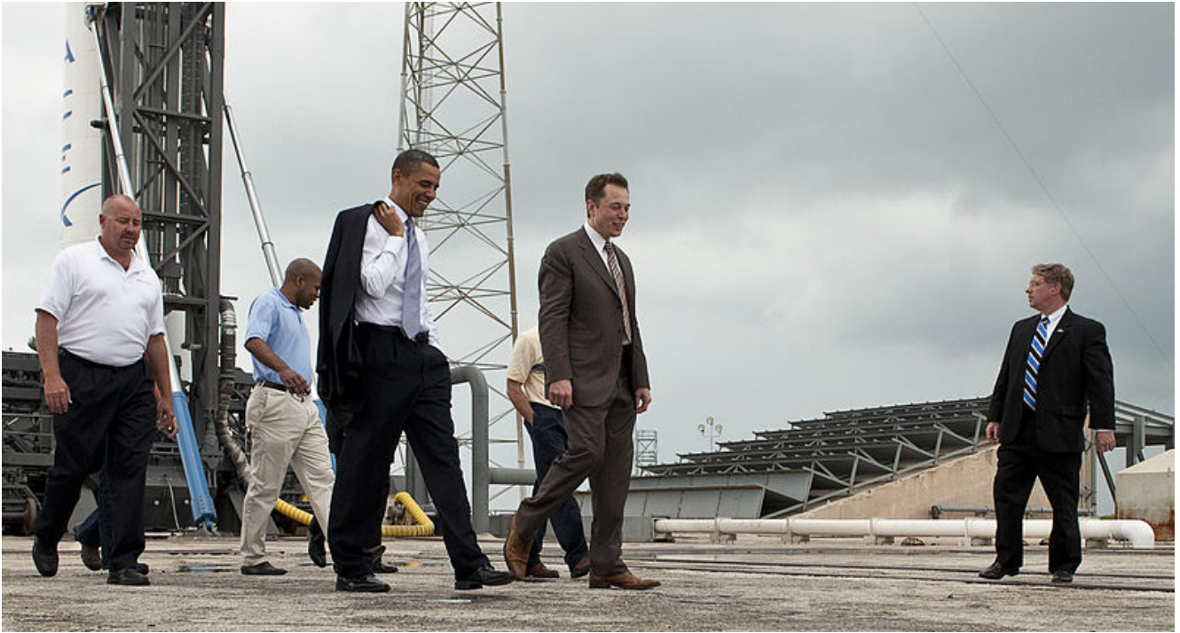
Musk and President Barack Obama at the Falcon 9 launch site seven years ago.

According to the Wall Street Journal, Musk's new company, registered in California, is a research company specializing in human biology and related technology. But with little information circulating the internet, people are curious about his new project.