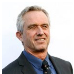
Robert F. Kennedy, Jr.

We might recall, at this strange time in our history, my father's friend, Edward R. Murrow's warning: "The right to dissent ... is surely fundamental to the existence of a democratic society. That's the right that went first in every nation that stumbled down the trail to totalitarianism."