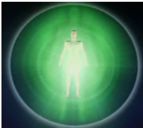
SCI0 figure 4: Mr Nagy 2.5 months after Elucidation (3rd activation)