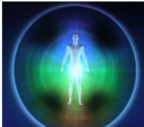
SCIO figure 1: someone who has received no Regenetics Method DNA activations

aura/biofield), and my intention is to carry out more structured longitudinal research using multiple scanning systems in conjunction with talented clairvoyants, in order to better ascertain what the quantifiable and qualitative effects of these DNA activations are in the long run. While the timing and frequency of Mr Nagy's scans were not part of a calculated research program or experiment (and thus, leave something to be desired), I am grateful to have them for illustrative purposes.