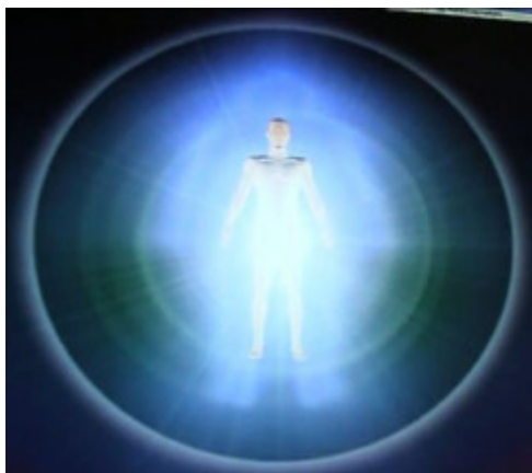
SCI0 figure 5: Mr Nagy 3 weeks after Transcension (fourth and final activation)